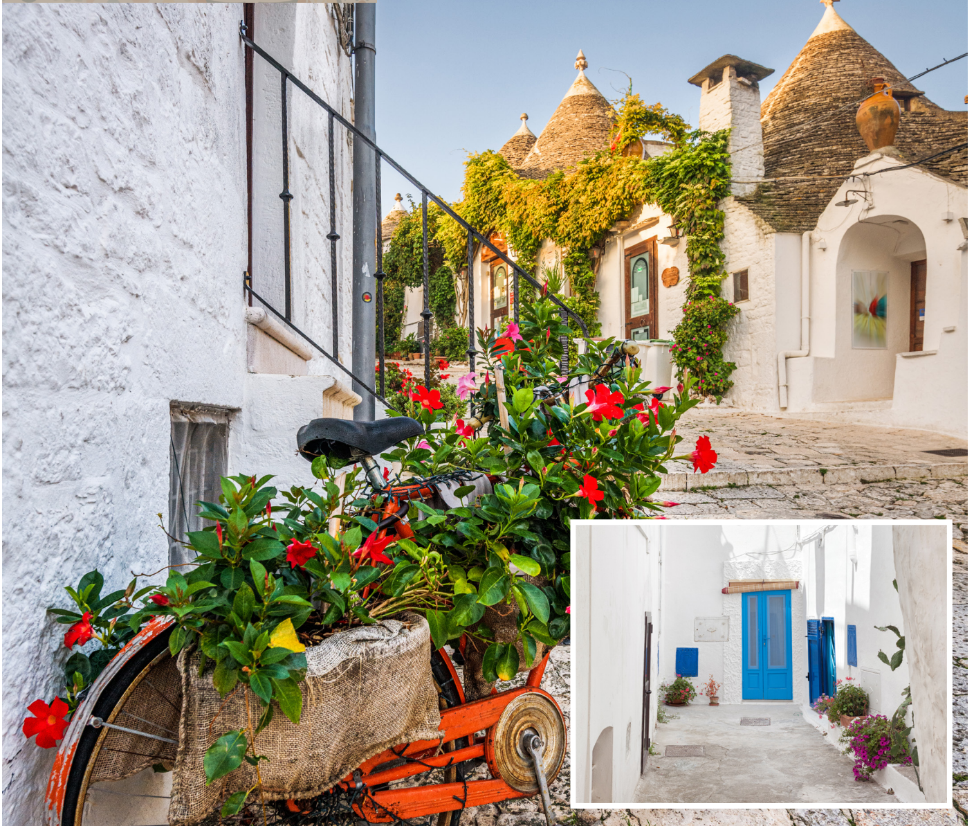
Trulli houses, Alberobello

6 Nights Inclusive From £2385 per person